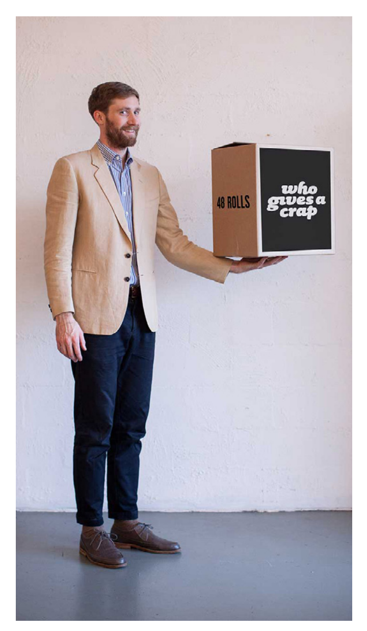
Who Gives A Crap—toilet paper that builds toilets, raised $66,548 to fund their first bulk toilet paper production run.

Try a "stunt" in the closing days/hours of your campaign. The 'Who Gives a Crap' campaign is a great example: "I won't get off the toilet until we've raised $50,000 - and I'm going to livestream the whole thing."<sup>33</sup>